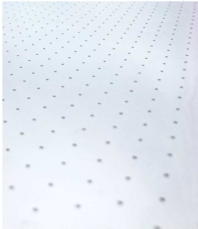
FF-OSR GLUED ON A RIGID METALLIC SUBSTRATE.

Space qualified for the thermal control of spacecrafts in 15 years GEO missions.